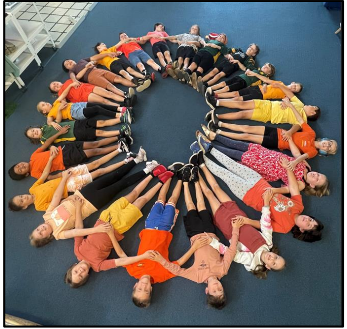
TA3 students celebrating with a Harmony Circle

Last week we celebrated Harmony Day. It was a wonderful week filled with celebration and appreciation for the diverse cultures within our school and community. On Thursday the school was filled with a sea of orange and some outfits that represented where our students' have connections. Our talented canteen ladies prepared a canteen lunch for the children exploring the different cuisines of the world and the food was absolutely delicious!