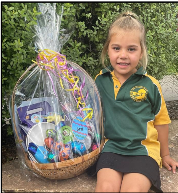
3 rd Prize