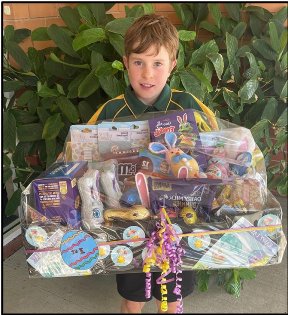
1 st Prize