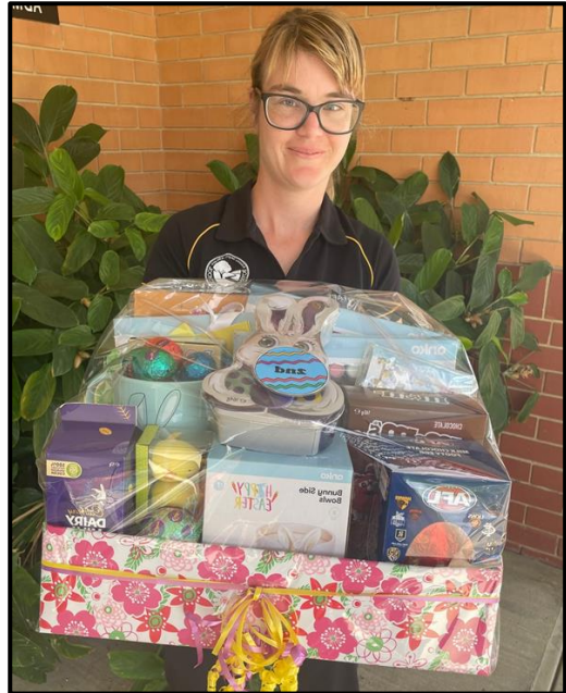
2 nd Prize