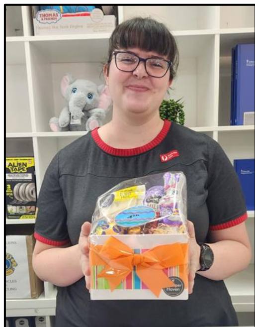
4 th Prize